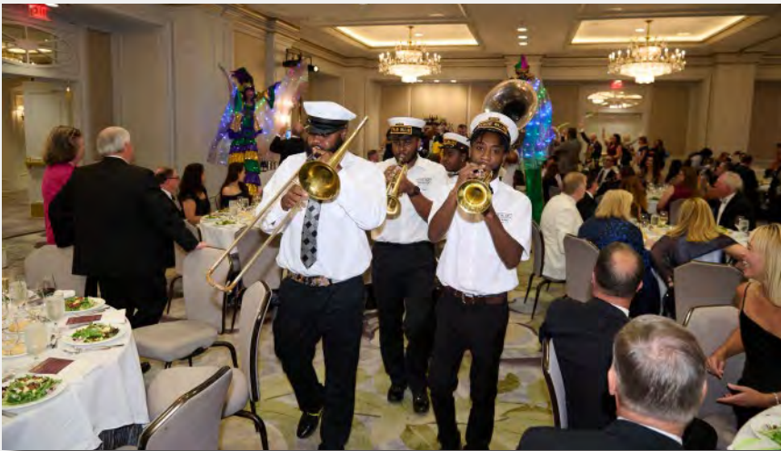
Members of the True Blue Brass Band get the party started with a festive march into the ballroom