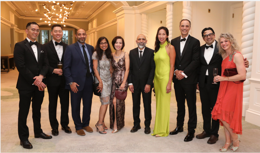
Examiners and guests stop for a photo during cocktail hour