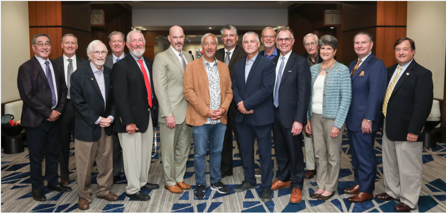
Past Presidents gather for a photo at the annual brunch at the Hyatt Regency Orlando