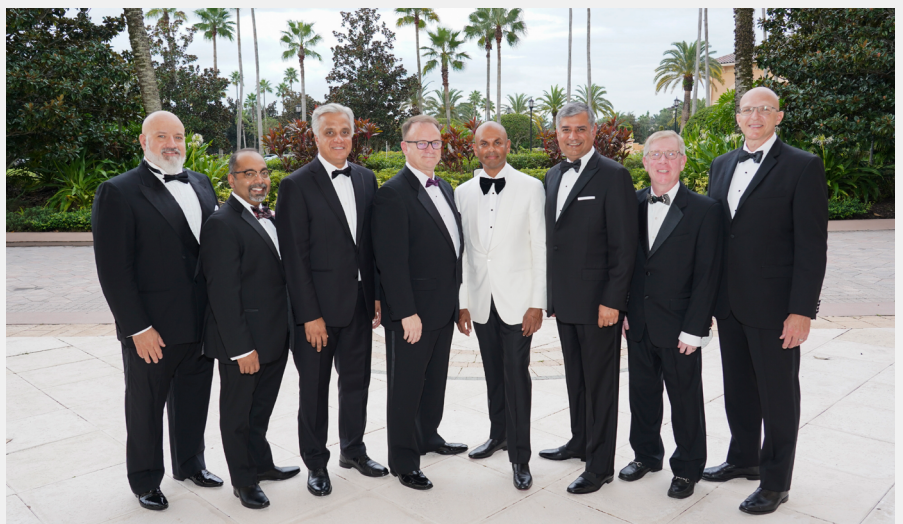
ABOMS' 2024-2025 Board of Directors outside of the JW Marriott Orlando Grande Lakes