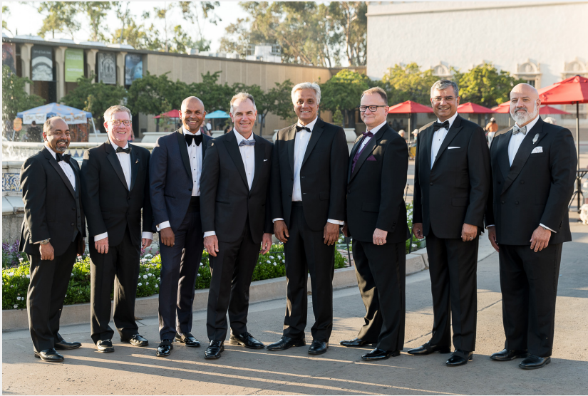
2023-2024 Board of Directors