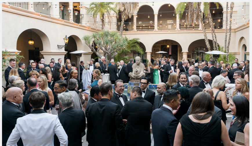
The Fountain Courtyard of The Prado in Balboa Park made a picturesque setting for guests to mingle during cocktail hour.