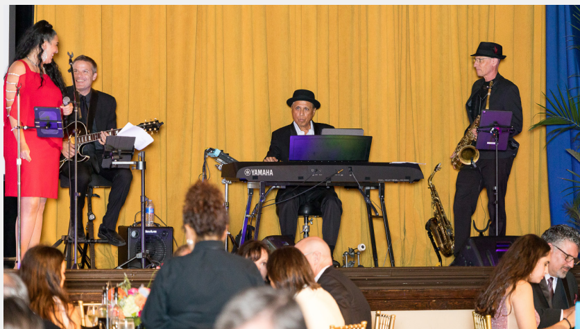
The band of the evening, Third Coast Jazz, prepares another song for entertaining the crowd during dinner.