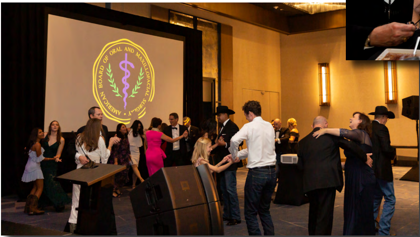
Guests get on their feet for an impromptu dance party