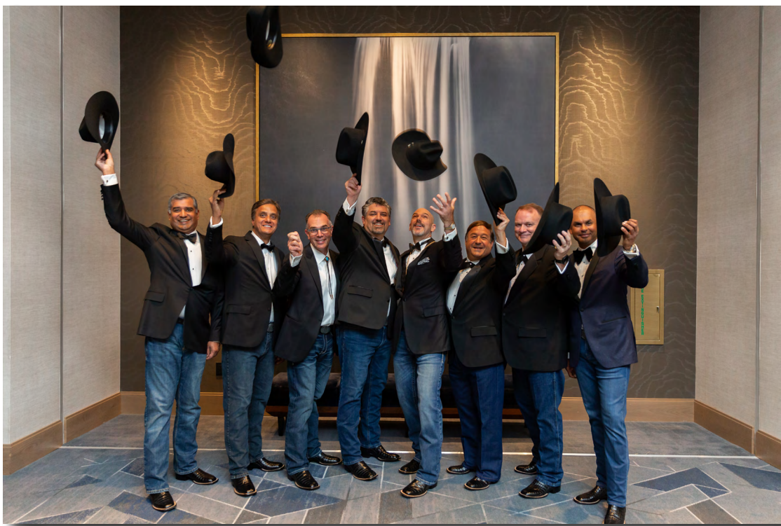
“Hats Off” to another great year!