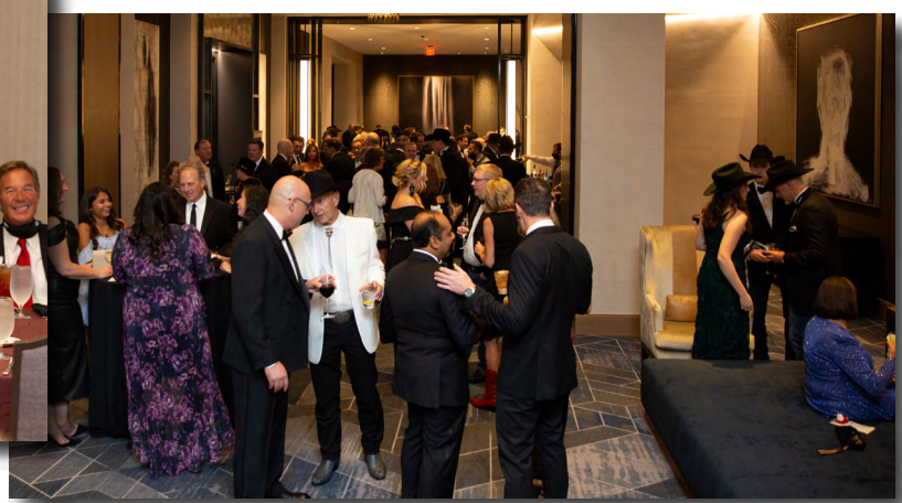
Guests mingle at the cocktail hour of the annual gala and dinner at the JW Marriott Nashville