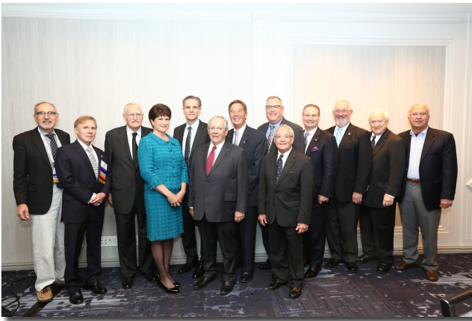
Some of our ABOMS Past Presidents gathered at our Past President and Spouse Brunch during the Annual Meeting in Chicago