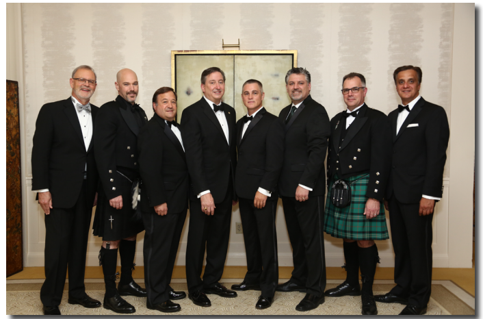
2017-2018 ABOMS Board of Directors ready for the Gala at the Peninsula Hotel